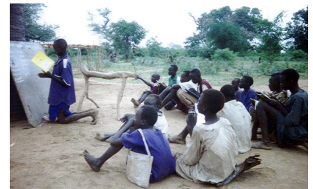
Primary schools in South Sudan

identified and referred by UNHCR, although some refugees directly apply for resettlement through UNHCR or Australian consular offices. Sudanese people who enter Australia under other migrant categories, or who apply for asylum after reaching Australia, cannot access the range of entitlements and services offered to those who enter under the Offshore Humanitarian program. These limitations place further burdens on their resettlement in Australia. It is therefore helpful to understand the migration status of Sudanese people