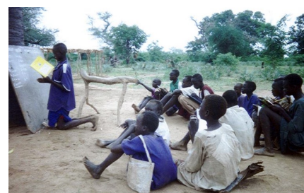
Primary schools in South Sudan

identified and referred by UNHCR, although some refugees directly apply for resettlement through UNHCR or Australian consular offices. Sudanese people who enter Australia under other migrant categories, or who apply for asylum after reaching Australia, cannot access the range of entitlements and services offered to those who enter under the Offshore Humanitarian program. These limitations place further burdens on their resettlement in Australia. It is therefore helpful to understand the migration status of Sudanese people